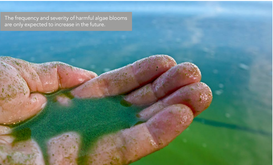
The frequency and severity of harmful algae blooms are only expected to increase in the future.