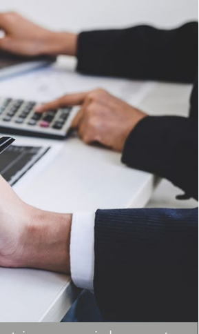
ertain processes in-house, o a kev strategic decision.

When a firm aims to implement strategies to achieve sustainable, competitive advantage, RBV approaches this as a problem that should first be tackled by identifying the unique resources of the firm, instead of evaluating the external circumstances and then trying to exploit an opportunity in the market. These internal resources are most valuable when they are not easily replicable by competitors, and require time to build up, e.g., employee