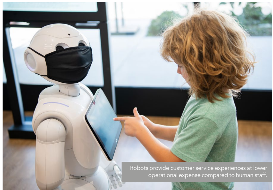
Robots provide customer service experiences at lower operational expense compared to human staff.